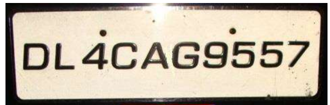
Fig. 1. Image Acquired from Input

The first step in the process is to acquire the image. In the suggested method, we will take an input image from the user to aid the recognition process of the number plate, as shown in Fig. 1.