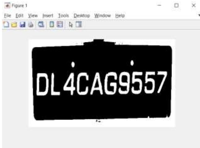
Fig. 2. RGB to B/W converted Image

The RGB colour group consists of three primary colours, that is Red, Green and Blue. Greyscale, on the other hand, is composed of two main colours that are black and white. Therefore, this aids in quicker processing. This can be seen in Fig. 2.