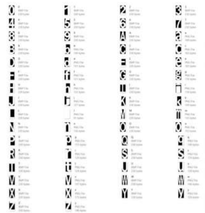
Fig. 4. Template used for Template Matching