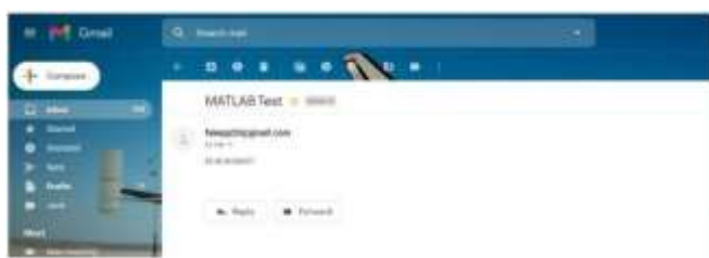
Fig. 6. Image of E-mail

The system thus successfully recognizes all the characters from the input image by neglecting the surrounding environment. The system can segment each and every character individually for recognition. It displays the number plate of the desired vehicle and also sends a mail to the registered mail id that is present in the program so that it cannot be changed by the user.